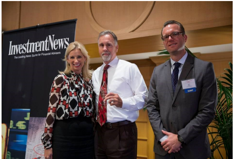
Accepting the "Best Practices Award" for Top Innovator

As part of accepting this award, I was given the opportunity to travel to Chicago to participate in a best practices panel and workshop, educating other top advisors on what we are doing that is working and why. Throughout these interviews, I kept coming back to you, the client.